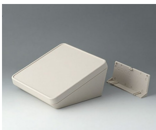
B4418207 PROTEC 180, Vers. II ASA+PC (UL 94 V-0) off-white RAL 9002 7.09"x7.09"x3.62" IP 65 opt.