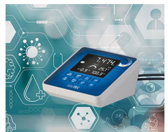
Laboratory measuring device