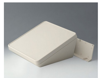
B4422207 PROTEC 220, Vers. II ASA+PC (UL 94 V-0) off-white RAL 9002 8.66"x8.66"x4.25" IP 65 opt.