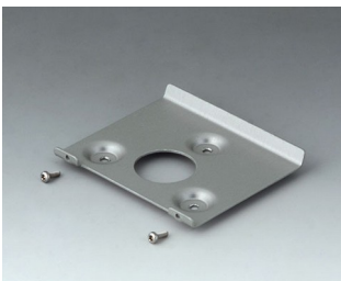
B4514101 Wall suspension element 140 Aluminum