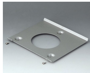
B4522101 Wall suspension element 220 Aluminum