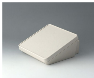
B4418307 PROTEC 180, Vers. III ASA+PC (UL 94 V-0) off-white RAL 9002 7.09"x7.91"x3.62" IP 65 opt.