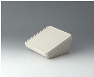
B4414107 PROTEC 140, Vers. I ASA+PC (UL 94 V-0) off-white RAL 9002 5.51"x5.51"x2.99" IP 65 opt.