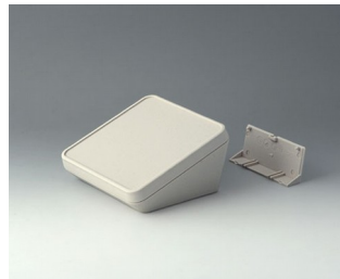
B4414207 PROTEC 140, Vers. II ASA+PC (UL 94 V-0) off-white RAL 9002 5.51"x5.51"x2.99" IP 65 opt.