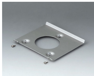
B4518101 Wall suspension element 180 Aluminum