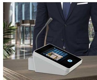
Table microphone / inter phone