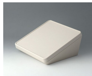
B4422107 PROTEC 220, Vers. I ASA+PC (UL 94 V-0) off-white RAL 9002 8.66"x8.66"x4.25" IP 65 opt.