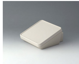
B4414307 PROTEC 140, Vers. III ASA+PC (UL 94 V-0) off-white RAL 9002 5.51"x6.30"x2.99" IP 65 opt.