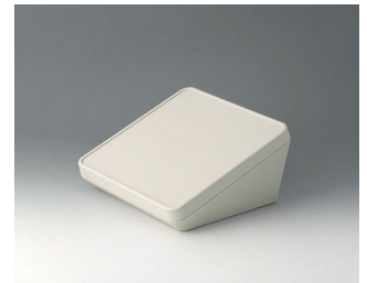
B4418107 PROTEC 180, Vers. I ASA+PC (UL 94 V-0) off-white RAL 9002 7.09"x7.09"x3.62" IP 65 opt.