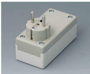
A9011665 PLUG CASE F / D, Vers. I PC+ABS (UL 94 V-0) off-white RAL 9002 3.94"x1.97"x1.57"