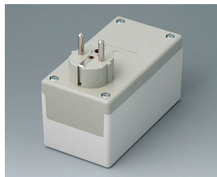
A9021665 PLUG CASE F / D, Vers. I PC+ABS (UL 94 V-0) pebble gray RAL 7032 4.72"x2.56"x2.56"