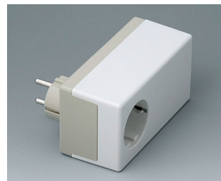
A9022465 PLUG CASE D, Vers. II PC+ABS (UL 94 V-0) pebble gray RAL 7032 4.72"x2.56"x2.17"