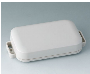
C3207107 EASYTEC 125 ASA+PC (UL 94 V-0) off-white RAL 9002 5.79"x3.07"x1.18" IP 65 opt., IP 40