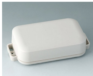
C3207207 EASYTEC 125 ASA+PC (UL 94 V-0) off-white RAL 9002 5.79"x3.07"x1.46" IP 65 opt., IP 40