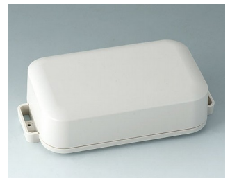
C3208207 EASYTEC 150 ASA+PC (UL 94 V-0) off-white RAL 9002 6.77"x3.66"x1.81" IP 65 opt., IP 40