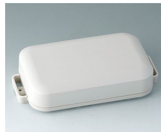
C3208107 EASYTEC 150 ASA+PC (UL 94 V-0) off-white RAL 9002 6.77"x3.66"x1.42" IP 65 opt., IP 40