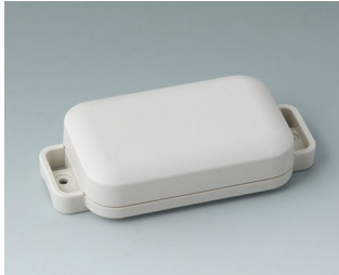
C3204107 EASYTEC 80 ASA+PC (UL 94 V-0) off-white RAL 9002 3.98"x1.97"x0.87" IP 65 opt., IP 40