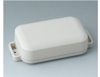
C3206207 EASYTEC 100 ASA+PC (UL 94 V-0) off-white RAL 9002 4.76"x2.44"x1.22" IP 65 opt., IP 40