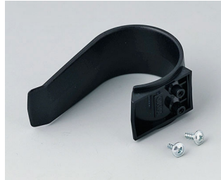
A9167029 Holding clamp PA 6 (UL 94 HB) black RAL 9005