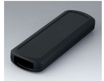
B2834109 CONNECT M ASA+PC (UL 94 V-0) black RAL 9005 6.14"x2.13"x0.87"