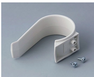
A9167027 Holding clamp PA 6 (UL 94 HB) off-white RAL 9002