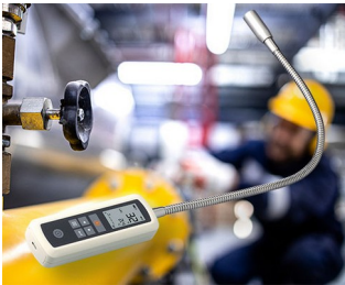
Gas leak detector

Data systems engineering, network technology, building services systems, safety engineering, IoT/ IIoT, medical and therapeutic applications, analytical instruments in the laboratory, measuring technology, including detectors with measuring sensors, test systems/instruments, data loggers in environmental technology, sensor systems, etc.