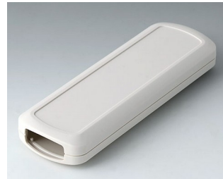
B2834107 CONNECT M ASA+PC (UL 94 V-0) off-white RAL 9002 6.14"x2.13"x0.87"