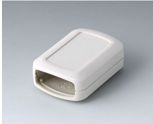
B2822107 CONNECT S ASA+PC (UL 94 V-0) off-white RAL 9002 2.36"x1.65"x0.87"