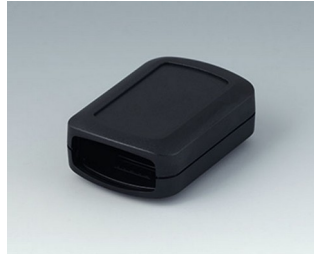
B2822109 CONNECT S ASA+PC (UL 94 V-0) black RAL 9005 2.36"x1.65"x0.87"