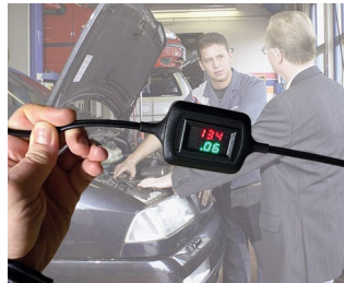
Voltage and current display during trickle charging