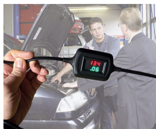
Voltage and current display during trickle charging