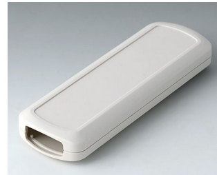
B2834107 CONNECT M ASA+PC (UL 94 V-0) off-white RAL 9002 6.14"x2.13"x0.87"