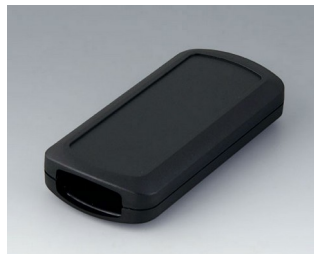
B2833109 CONNECT M ASA+PC (UL 94 V-0) black RAL 9005 4.57"x2.13"x0.87"