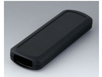
B2834109 CONNECT M ASA+PC (UL 94 V-0) black RAL 9005 6.14"x2.13"x0.87"