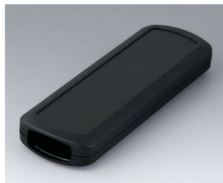
B2834109 CONNECT ASA+PC-FR (UL 94 V-0) black RAL 9005 6.14"x2.13"x0.87"