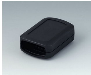
B2822109 CONNECT S ASA+PC (UL 94 V-0) black RAL 9005 2.36"x1.65"x0.87"