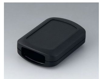
B2832109 CONNECT M ASA+PC (UL 94 V-0) black RAL 9005 2.99"x2.13"x0.87"