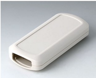
B2833107 CONNECT M ASA+PC (UL 94 V-0) off-white RAL 9002 4.57"x2.13"x0.87"