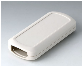
B2833107 CONNECT M ASA+PC (UL 94 V-0) off-white RAL 9002 4.57"x2.13"x0.87"