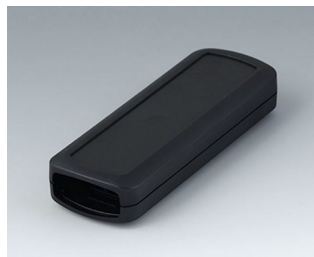
B2824109 CONNECT S ASA+PC (UL 94 V-0) black RAL 9005 4.72"x1.65"x0.87"