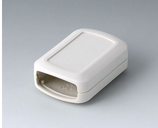
B2822107 CONNECT S ASA+PC (UL 94 V-0) off-white RAL 9002 2.36"x1.65"x0.87"