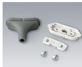
B2911328 Cable gland kit, 0.197" - 0.232" SEBS (TPE) volcano