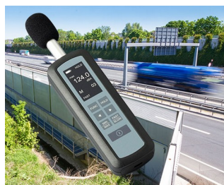
Noise level measurement