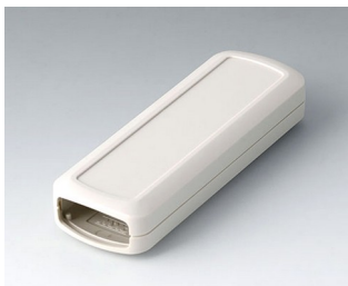
B2824107 CONNECT S ASA+PC (UL 94 V-0) off-white RAL 9002 4.72"x1.65"x0.87"