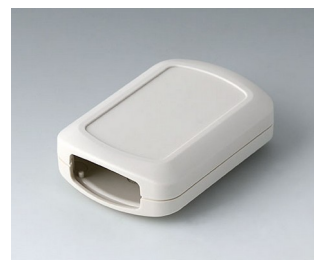
B2832107 CONNECT M ASA+PC (UL 94 V-0) off-white RAL 9002 2.99"x2.13"x0.87"