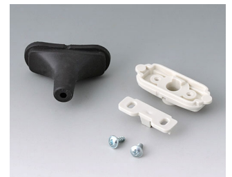
B2911309 Cable gland kit, 0.134" - 0.165" SEBS (TPE) black RAL 9005