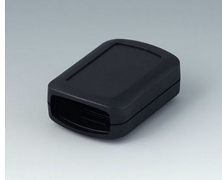
B2822109 CONNECT S ASA+PC (UL 94 V-0) black RAL 9005 2.36"x1.65"x0.87"