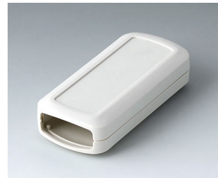
B2823107 CONNECT S ASA+PC (UL 94 V-0) off-white RAL 9002 3.54"x1.65"x0.87"