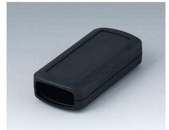
B2823109 CONNECT S ASA+PC (UL 94 V-0) black RAL 9005 3.54"x1.65"x0.87"