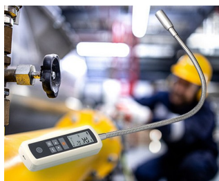
Gas leak detector

Data systems engineering, network technology, building services systems, safety engineering, IoT/ IIoT, medical and therapeutic applications, analytical instruments in the laboratory, measuring technology, including detectors with measuring sensors, test systems/instruments, data loggers in environmental technology, sensor systems, etc.