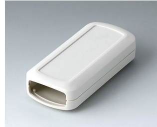
B2823107 CONNECT S ASA+PC (UL 94 V-0) off-white RAL 9002 3.54"x1.65"x0.87"