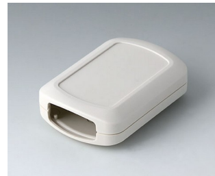
B2832107 CONNECT M ASA+PC (UL 94 V-0) off-white RAL 9002 2.99"x2.13"x0.87"