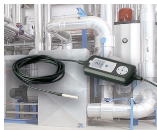
Process monitoring with temperature sensor