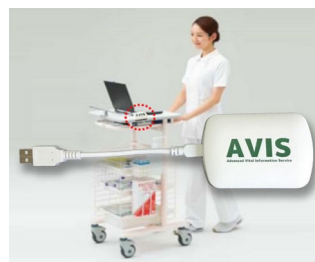
Receiver and data transfer for EMR