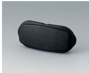
B2811209 End part ASA+PC (UL 94 V-0) black RAL 9005