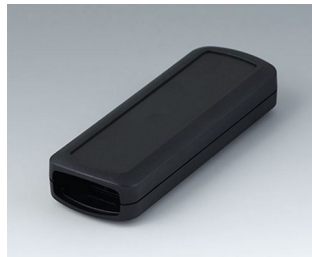
B2824109 CONNECT S ASA+PC (UL 94 V-0) black RAL 9005 4.72"x1.65"x0.87"