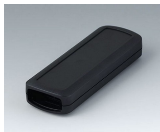
B2824109 CONNECT S ASA+PC (UL 94 V-0) black RAL 9005 4.72"x1.65"x0.87"