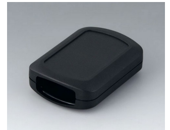
B2832109 CONNECT M ASA+PC (UL 94 V-0) black RAL 9005 2.99"x2.13"x0.87"