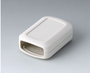
B2822107 CONNECT S ASA+PC (UL 94 V-0) off-white RAL 9002 2.36"x1.65"x0.87"