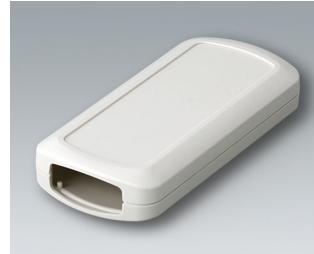
B2833107 CONNECT ASA+PC-FR (UL 94 V-0) off-white RAL 9002 4.57"x2.13"x0.87"