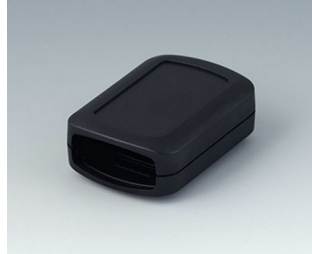
B2822109 CONNECT S ASA+PC (UL 94 V-0) black RAL 9005 2.36"x1.65"x0.87"