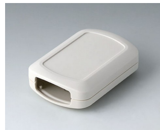
B2832107 CONNECT M ASA+PC (UL 94 V-0) off-white RAL 9002 2.99"x2.13"x0.87"