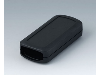
B2823109 CONNECT S ASA+PC (UL 94 V-0) black RAL 9005 3.54"x1.65"x0.87"