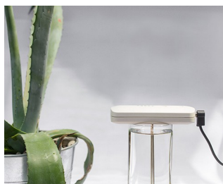
Tool for making colloidal silver solutions