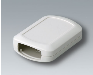
B2832107 CONNECT ASA+PC-FR (UL 94 V-0) off-white RAL 9002 2.99"x2.13"x0.87"