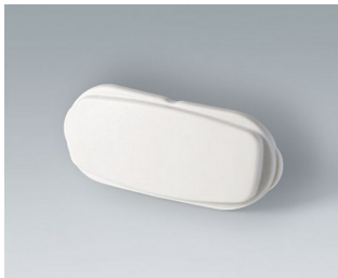
B2811207 End part ASA+PC (UL 94 V-0) off-white RAL 9002