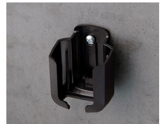
B2921509 Holder S ASA+PC (UL 94 V-0) black RAL 9005