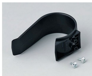
A9167029 Holding clamp PA 6 (UL 94 HB) black RAL 9005