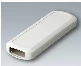
B2834107 CONNECT ASA+PC-FR (UL 94 V-0) off-white RAL 9002 6.14"x2.13"x0.87"