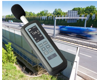
Noise level measurement