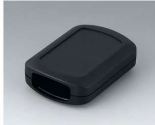
B2832109 CONNECT ASA+PC-FR (UL 94 V-0) black RAL 9005 2.99"x2.13"x0.87"