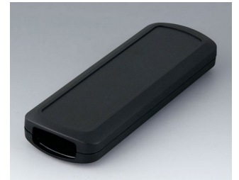
B2834109 CONNECT M ASA+PC (UL 94 V-0) black RAL 9005 6.14"x2.13"x0.87"