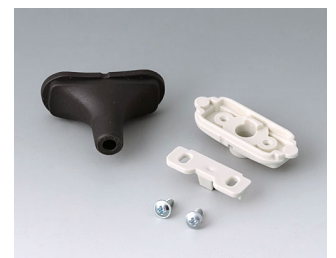
B2911329 Cable gland kit, 0.197" - 0.232" SEBS (TPE) black RAL 9005