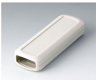
B2824107 CONNECT S ASA+PC (UL 94 V-0) off-white RAL 9002 4.72"x1.65"x0.87"