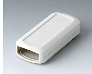
B2823107 CONNECT S ASA+PC (UL 94 V-0) off-white RAL 9002 3.54"x1.65"x0.87"