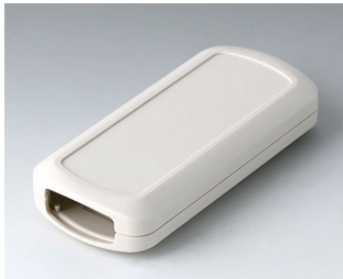
B2833107 CONNECT M ASA+PC (UL 94 V-0) off-white RAL 9002 4.57"x2.13"x0.87"