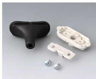
B2911319 Cable gland kit, 0.165" - 0.197" SEBS (TPE) black RAL 9005