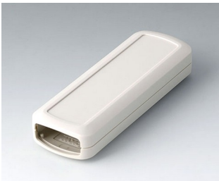
B2824107 CONNECT S ASA+PC (UL 94 V-0) off-white RAL 9002 4.72"x1.65"x0.87"