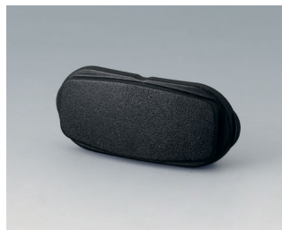
B2811209 End part ASA+PC-FR (UL 94 V-0) black RAL 9005