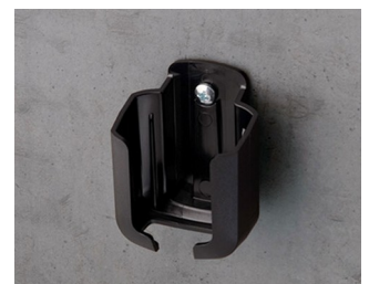
B2921509 Holder S ASA+PC (UL 94 V-0) black RAL 9005