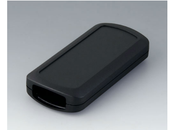
B2833109 CONNECT ASA+PC-FR (UL 94 V-0) black RAL 9005 4.57"x2.13"x0.87"