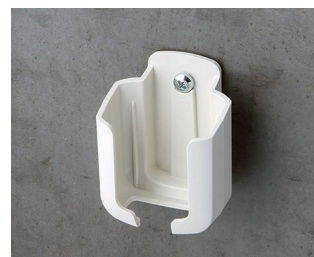
B2921507 Holder S ASA+PC (UL 94 V-0) off-white RAL 9002