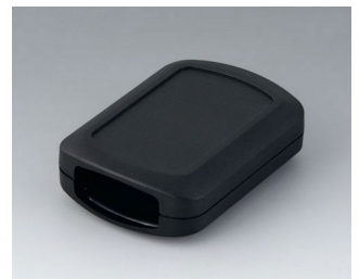
B2832109 CONNECT M ASA+PC (UL 94 V-0) black RAL 9005 2.99"x2.13"x0.87"