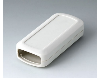
B2823107 CONNECT S ASA+PC (UL 94 V-0) off-white RAL 9002 3.54"x1.65"x0.87"