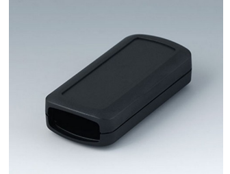
B2823109 CONNECT S ASA+PC (UL 94 V-0) black RAL 9005 3.54"x1.65"x0.87"