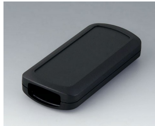
B2833109 CONNECT M ASA+PC (UL 94 V-0) black RAL 9005 4.57"x2.13"x0.87"