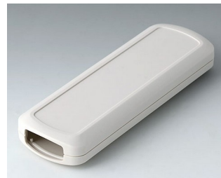
B2834107 CONNECT M ASA+PC (UL 94 V-0) off-white RAL 9002 6.14"x2.13"x0.87"