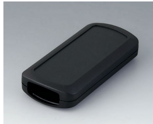
B2833109 CONNECT M ASA+PC (UL 94 V-0) black RAL 9005 4.57"x2.13"x0.87"