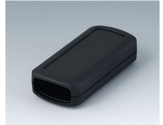
B2823109 CONNECT S ASA+PC (UL 94 V-0) black RAL 9005 3.54"x1.65"x0.87"