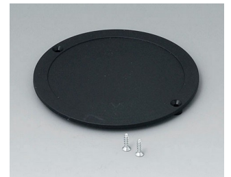
B5011849 Lid ABS (UL 94 HB) black RAL 9005