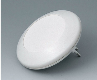
B5011227 ART-CASE R110 F PC+ABS (UL 94 V-0) off-white RAL 9002 ø4.33"x1.50" IP 40