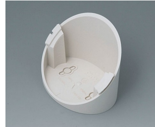
B5011317 Base 55° ABS (UL 94 HB) off-white RAL 9002