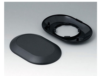
B5015009 Bottom and top part O160 F ABS (UL 94 HB) black RAL 9005 6.30"x4.33"x1.18"