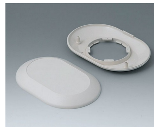
B5015007 Bottom and top part O160 F ABS (UL 94 HB) off-white RAL 9002 6.30"x4.33"x1.18"