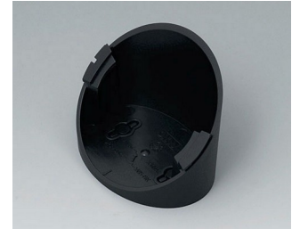
B5011319 Base 55° ABS (UL 94 HB) black RAL 9005