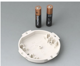
B5111107 Battery compartment, 2 x AAA ABS (UL 94 HB) off-white RAL 9002