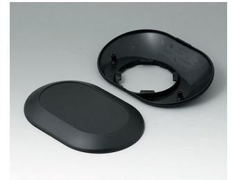
B5015209 Bottom and top part O160 F ABS (UL 94 HB) black RAL 9005 6.30"x4.33"x1.50"