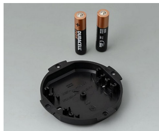
B5111109 Battery compartment, 2 x AAA ABS (UL 94 HB) black RAL 9005