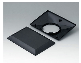
B5017209 Bottom and top part E160 F ABS (UL 94 HB) black RAL 9005 6.30"x4.33"x1.50"