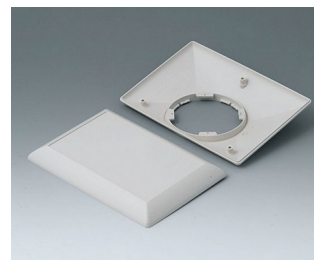
B5017207 Bottom and top part E160 F ABS (UL 94 HB) off-white RAL 9002 6.30"x4.33"x1.50"