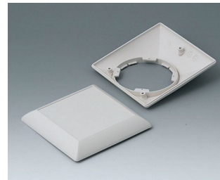
B5012207 Bottom and top part S110F ABS (UL 94 HB) off-white RAL 9002 4.33"x4.33"x1.50"