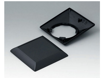
B5012209 Bottom and top part S110F ABS (UL 94 HB) black RAL 9005 4.33"x4.33"x1.50"