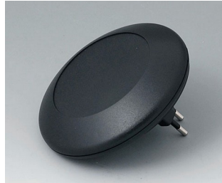
B5011229 ART-CASE R110 F PC+ABS (UL 94 V-0) black RAL 9005 ø4.33"x1.50" IP 40