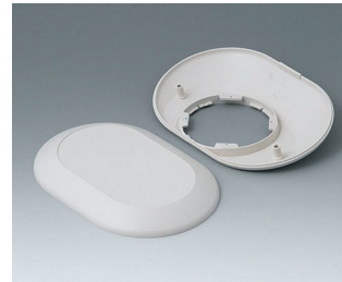
B5015207 Bottom and top part O160 F ABS (UL 94 HB) off-white RAL 9002 6.30"x4.33"x1.50"