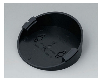
B5011219 Base 30° ABS (UL 94 HB) black RAL 9005