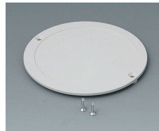
B5011847 Lid ABS (UL 94 HB) off-white RAL 9002