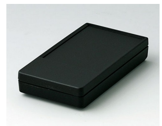
A9070119 DATEC-POCKET-BOX S ABS (UL 94 HB) black RAL 9005 3.35"x1.81"x0.63" IP 54