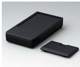
A9072129 DATEC-POCKET-BOX L ABS (UL 94 HB) black RAL 9005 4.72"x2.56"x0.87" IP 41