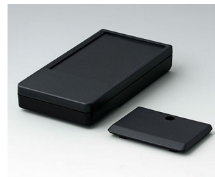
A9072209 DATEC-POCKET-BOX L PMMA (IR) (UL 94 HB) black RAL 9005 4.72"x2.56"x0.87" IP 41