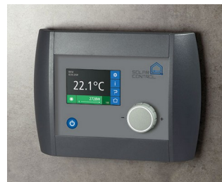
Solar Control Panel