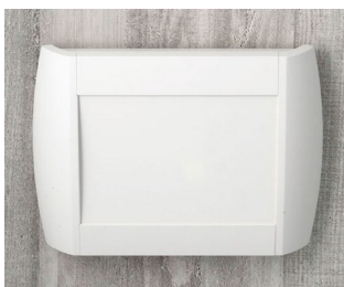
A9094107 DIATEC M ABS (UL 94 HB) off-white RAL 9002 10.63"x1.89"x7.87" IP 40