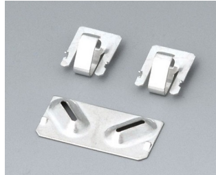
A9190002 Set of battery clips, 2xN/2xAA/2xAAA Steel tin-plated