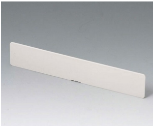
A9194007 Slot-in panel ABS (UL 94 HB) off-white RAL 9002 6.14"x1.18"x0.12"