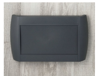
A9095108 DIATEC L ABS (UL 94 HB) lava 12.99"x1.89"x7.87" IP 40