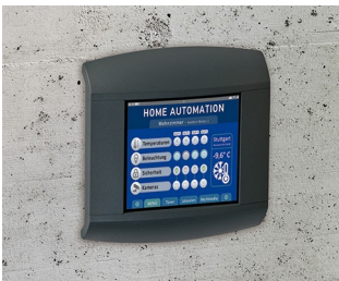
Control panel for home automation