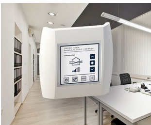
Indoor air quality control