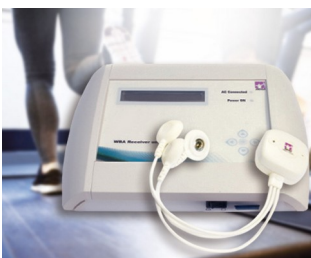
WBA receiver unit for measuring biosignals