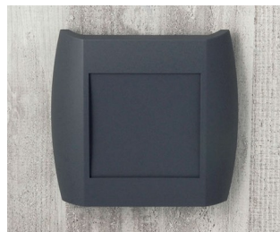
A9092108 DIATEC XS ABS (UL 94 HB) lava 5.91"x1.46"x6.10" IP 40