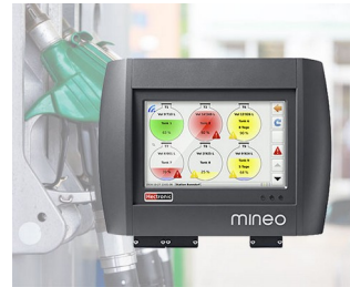
Controller for intelligent tank management