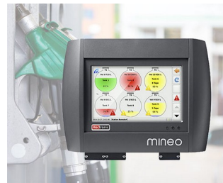
Controller for intelligent tank management