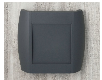
A9093108 DIATEC S ABS (UL 94 HB) lava 8.27"x1.89"x7.87" IP 40