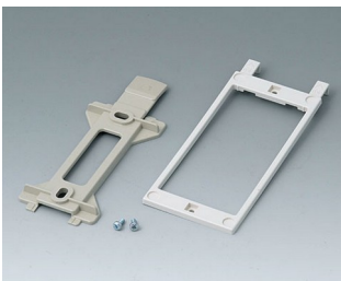
B1360048 Wall suspension elements ABS (UL 94 HB) pebble gray RAL 7032