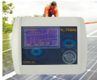
Control unit for photovoltaic solar installations