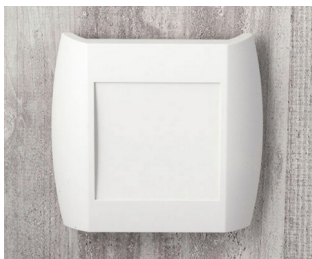
A9092107 DIATEC XS ABS (UL 94 HB) off-white RAL 9002 5.91"x1.46"x6.10" IP 40