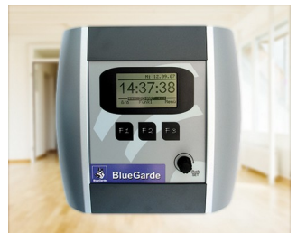
House control unit