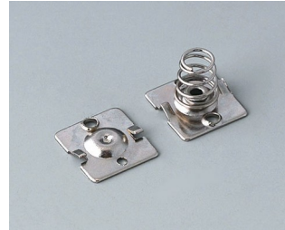
A9190015 Set of battery clips, 2 x AA Steel nickel-plated