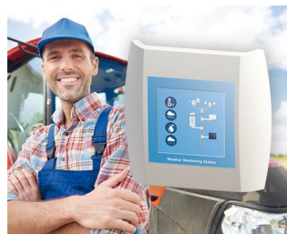
Weather Monitoring Station