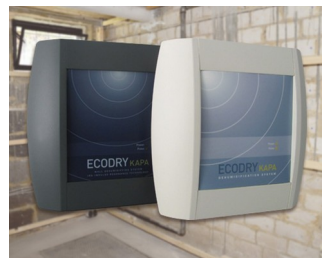
Systems for drying brickwork