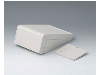
B4054337 UNITEC S, 0.02/0.06 ABS (UL 94 HB) off-white RAL 9002 4.92"x6.97"x2.72" IP 40