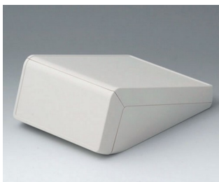
B4056107 UNITEC M, 0.02/0.02 ABS (UL 94 HB) off-white RAL 9002 5.83"x8.27"x3.15" IP 40