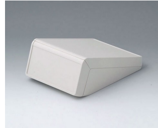
B4054127 UNITEC S, 0.06/0.02 ABS (UL 94 HB) off-white RAL 9002 4.92"x6.97"x2.72" IP 40