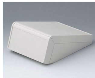
B4056127 UNITEC M, 0.06/0.02 ABS (UL 94 HB) off-white RAL 9002 5.83"x8.27"x3.15" IP 40