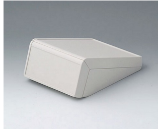
B4054117 UNITEC S, 0.06/0.06 ABS (UL 94 HB) off-white RAL 9002 4.92"x6.97"x2.72" IP 40