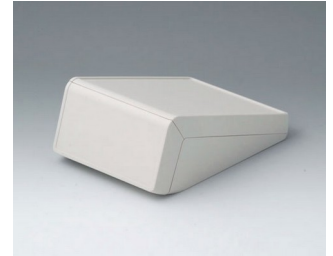
B4054137 UNITEC S, 0.02/0.06 ABS (UL 94 HB) off-white RAL 9002 4.92"x6.97"x2.72" IP 40