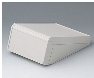
B4056117 UNITEC M, 0.06/0.06 ABS (UL 94 HB) off-white RAL 9002 5.83"x8.27"x3.15" IP 40