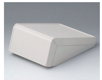
B4056137 UNITEC M, 0.02/0.06 ABS (UL 94 HB) off-white RAL 9002 5.83"x8.27"x3.15" IP 40