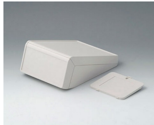
B4054317 UNITEC S, 0.06/0.06 ABS (UL 94 HB) off-white RAL 9002 4.92"x6.97"x2.72" IP 40