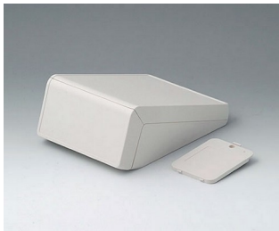
B4054207 UNITEC S, 0.02/0.02 ABS (UL 94 HB) off-white RAL 9002 4.92"x6.97"x2.72" IP 40