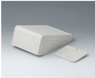
B4054307 UNITEC S, 0.02/0.02 ABS (UL 94 HB) off-white RAL 9002 4.92"x6.97"x2.72" IP 40