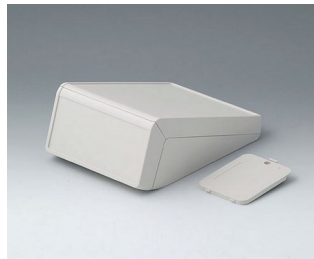
B4054217 UNITEC S, 0.06/0.06 ABS (UL 94 HB) off-white RAL 9002 4.92"x6.97"x2.72" IP 40