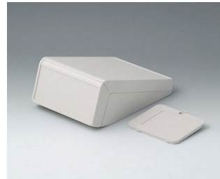
B4054327 UNITEC S, 0.06/0.02 ABS (UL 94 HB) off-white RAL 9002 4.92"x6.97"x2.72" IP 40