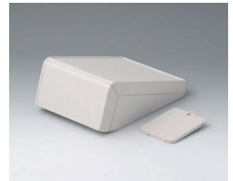
B4054237 UNITEC S, 0.02/0.06 ABS (UL 94 HB) off-white RAL 9002 4.92"x6.97"x2.72" IP 40