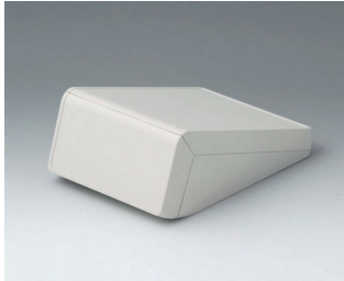
B4054107 UNITEC S, 0.02/0.02 ABS (UL 94 HB) off-white RAL 9002 4.92"x6.97"x2.72" IP 40