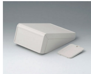
B4054227 UNITEC S, 0.06/0.02 ABS (UL 94 HB) off-white RAL 9002 4.92"x6.97"x2.72" IP 40