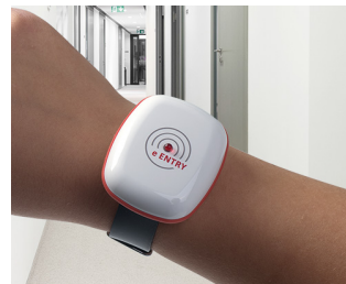
eEntry access and security controls