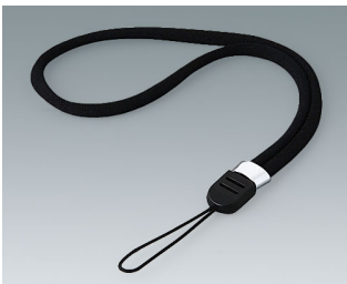
B9100043 Hand strap, woven black 7.87"