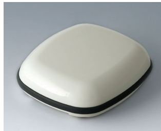
B1606117 BODY-CASE L, without recess ASA (UL 94 HB) traffic white RAL 9016 2.17"x1.81"x0.67" IP 65