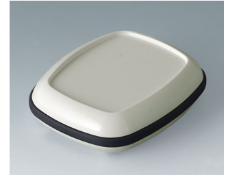
B1604217 BODY-CASE M, with recess ASA (UL 94 HB) traffic white RAL 9016 1.97"x1.61"x0.63" IP 65