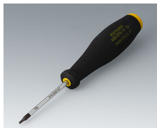
A0399T06 Torx T6 screwdriver

Subject to technical modification without notice. © by OKW Gehäusesysteme, Buchen/Germany.