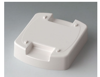
B1706807 Station L (Mountable) ASA (UL 94 HB) traffic white RAL 9016 2.44"x1.97"x0.67"