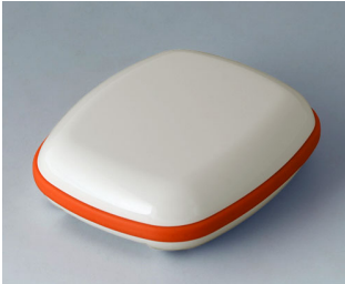
B1604107 BODY-CASE M, without recess ASA (UL 94 HB) traffic white RAL 9016 1.97"x1.61"x0.63" IP 65