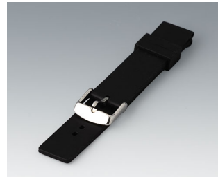
B1706202 Wrist strap, 18 mm Silicone black