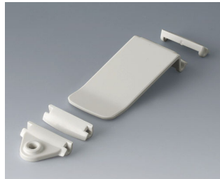
B1706001 Fastening kit ASA (UL 94 HB) traffic white RAL 9016