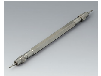
B1706203 Spring bar tool Stainless steel