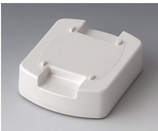
B1704017 Station M ASA (UL 94 HB) traffic white RAL 9016 2.44"x1.97"x0.67"