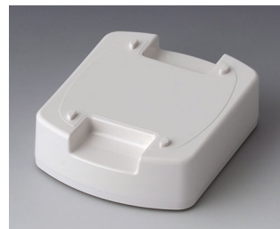
B1706017 Station L ASA (UL 94 HB) traffic white RAL 9016 2.44"x1.97"x0.67"