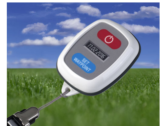
GPS tracking system