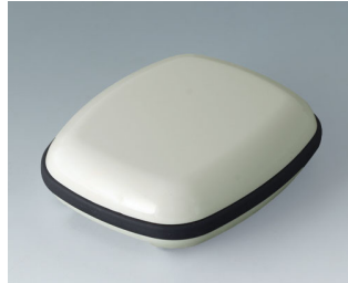
B1604117 BODY-CASE M, without recess ASA (UL 94 HB) traffic white RAL 9016 1.97"x1.61"x0.63" IP 65