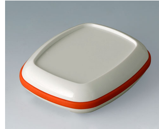
B1604207 BODY-CASE M, with recess ASA (UL 94 HB) traffic white RAL 9016 1.97"x1.61"x0.63" IP 65