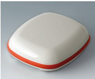
B1606107 BODY-CASE L, without recess ASA (UL 94 HB) traffic white RAL 9016 2.17"x1.81"x0.67" IP 65