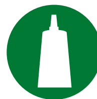
Installation / Assembly of accessories