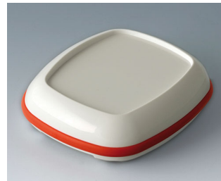
B1606207 BODY-CASE L, with recess ASA (UL 94 HB) traffic white RAL 9016 2.17"x1.81"x0.67" IP 65