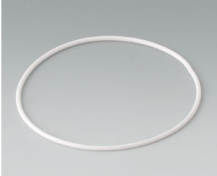
B1706003 Seal, for Station (Mountable) M/L