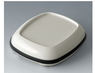
B1606217 BODY-CASE L, with recess ASA (UL 94 HB) traffic white RAL 9016 2.17"x1.81"x0.67" IP 65