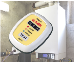
CO gas alert