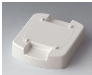
B1704807 Station M (Mountable) ASA (UL 94 HB) traffic white RAL 9016 2.44"x1.97"x0.67"