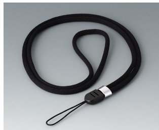
B9100063 Carrying strap, textile black 33.86"