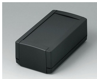
B1060369 TOPTEC 154 H, Vers. I ABS (UL 94 HB) black RAL 9005 6.06"x3.31"x2.20" IP 40