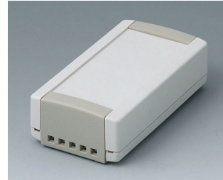
B1040465 TOPTEC 102, Vers. II ABS (UL 94 HB) off-white RAL 9002 4.02"x2.13"x1.18" IP 40