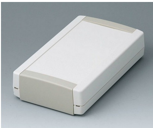
B1075365 TOPTEC 194 F, Vers. I ABS (UL 94 HB) off-white RAL 9002 7.64"x4.53"x1.81" IP 40