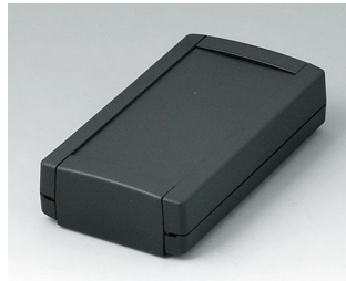
B1055369 TOPTEC 123 F, Vers. I ABS (UL 94 HB) black RAL 9005 4.84"x2.68"x1.18" IP 40