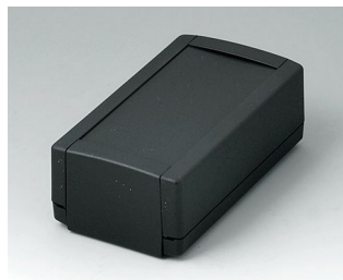
B1050369 TOPTEC 123 H, Vers. I ABS (UL 94 HB) black RAL 9005 4.84"x2.68"x1.77" IP 40