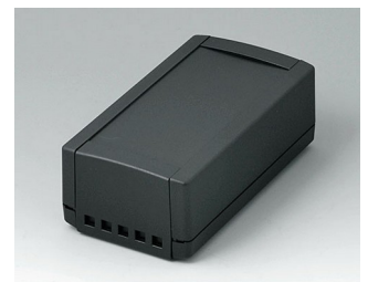
B1060469 TOPTEC 154 H, Vers. II ABS (UL 94 HB) black RAL 9005 6.06"x3.31"x2.20" IP 40