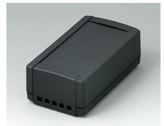
B1050469 TOPTEC 123 H, Vers. II ABS (UL 94 HB) black RAL 9005 4.84"x2.68"x1.77" IP 40