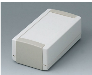
B1060365 TOPTEC 154 H, Vers. I ABS (UL 94 HB) off-white RAL 9002 6.06"x3.31"x2.20" IP 40