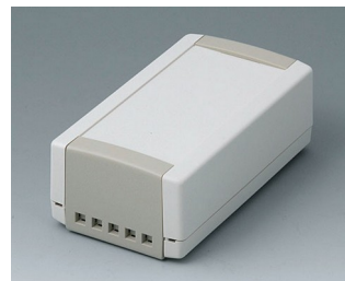
B1050465 TOPTEC 123 H, Vers. II ABS (UL 94 HB) off-white RAL 9002 4.84"x2.68"x1.77" IP 40