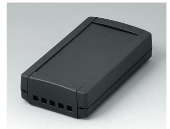
B1055469 TOPTEC 123 F, Vers. II ABS (UL 94 HB) black RAL 9005 4.84"x2.68"x1.18" IP 40