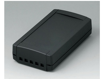
B1065469 TOPTEC 154 F, Vers. II ABS (UL 94 HB) black RAL 9005 6.06"x3.31"x1.50" IP 40