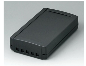
B1075469 TOPTEC 194 F, Vers. II ABS (UL 94 HB) black RAL 9005 7.64"x4.53"x1.81" IP 40