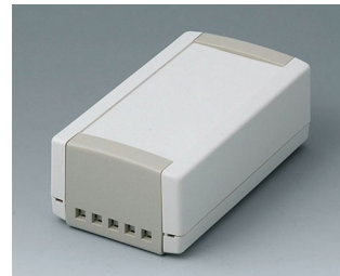
B1050465 TOPTEC 123 H, Vers. II ABS (UL 94 HB) off-white RAL 9002 4.84"x2.68"x1.77" IP 40