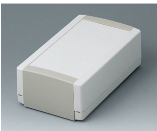
B1070365 TOPTEC 194 H, Vers. I ABS (UL 94 HB) off-white RAL 9002 7.64"x4.53"x2.68" IP 40