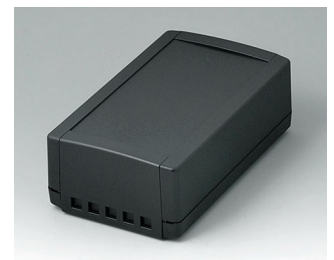
B1070469 TOPTEC 194 H, Vers. II ABS (UL 94 HB) black RAL 9005 7.64"x4.53"x2.68" IP 40