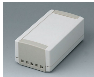
B1060465 TOPTEC 154 H, Vers. II ABS (UL 94 HB) off-white RAL 9002 6.06"x3.31"x2.20" IP 40