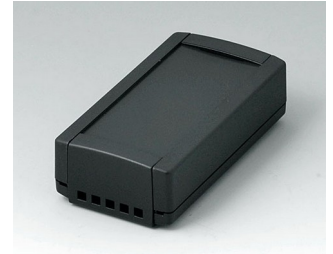
B1040469 TOPTEC 102, Vers. II ABS (UL 94 HB) black RAL 9005 4.02"x2.13"x1.18" IP 40