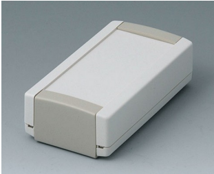
B1040365 TOPTEC 102, Vers. I ABS (UL 94 HB) off-white RAL 9002 4.02"x2.13"x1.18" IP 40