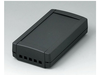
B1055469 TOPTEC 123 F, Vers. II ABS (UL 94 HB) black RAL 9005 4.84"x2.68"x1.18" IP 40