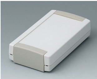
B1055365 TOPTEC 123 F, Vers. I ABS (UL 94 HB) off-white RAL 9002 4.84"x2.68"x1.18" IP 40