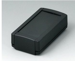
B1040369 TOPTEC 102, Vers. I ABS (UL 94 HB) black RAL 9005 4.02"x2.13"x1.18" IP 40