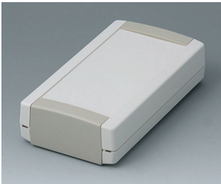
B1065365 TOPTEC 154 F, Vers. I ABS (UL 94 HB) off-white RAL 9002 6.06"x3.31"x1.50" IP 40