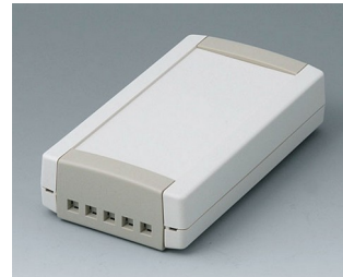
B1055465 TOPTEC 123 F, Vers. II ABS (UL 94 HB) off-white RAL 9002 4.84"x2.68"x1.18" IP 40