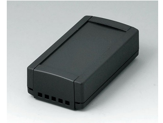
B1040469 TOPTEC 102, Vers. II ABS (UL 94 HB) black RAL 9005 4.02"x2.13"x1.18" IP 40