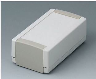
B1050365 TOPTEC 123 H, Vers. I ABS (UL 94 HB) off-white RAL 9002 4.84"x2.68"x1.77" IP 40