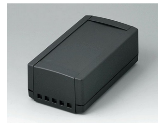
B1060469 TOPTEC 154 H, Vers. II ABS (UL 94 HB) black RAL 9005 6.06"x3.31"x2.20" IP 40