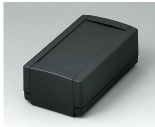
B1050369 TOPTEC 123 H, Vers. I ABS (UL 94 HB) black RAL 9005 4.84"x2.68"x1.77" IP 40