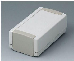
B1050365 TOPTEC 123 H, Vers. I ABS (UL 94 HB) off-white RAL 9002 4.84"x2.68"x1.77" IP 40