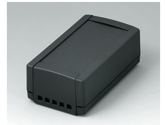
B1050469 TOPTEC 123 H, Vers. II ABS (UL 94 HB) black RAL 9005 4.84"x2.68"x1.77" IP 40