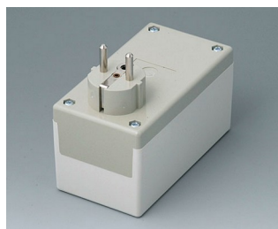
A9021665 PLUG CASE F / D, Vers. I PC+ABS (UL 94 V-0) pebble gray RAL 7032 4.72"x2.56"x2.56"