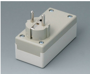
A9011665 PLUG CASE F / D, Vers. I PC+ABS (UL 94 V-0) off-white RAL 9002 3.94"x1.97"x1.57"