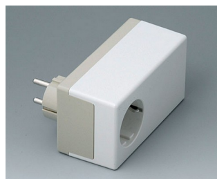
A9022465 PLUG CASE D, Vers. II PC+ABS (UL 94 V-0) pebble gray RAL 7032 4.72"x2.56"x2.17"