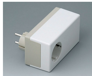
A9022465 PLUG CASE D, Vers. II PC+ABS (UL 94 V-0) pebble gray RAL 7032 4.72"x2.56"x2.17"