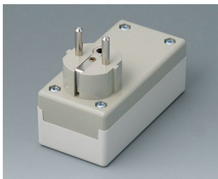
A9011665 PLUG CASE F / D, Vers. I PC+ABS (UL 94 V-0) off-white RAL 9002 3.94"x1.97"x1.57"