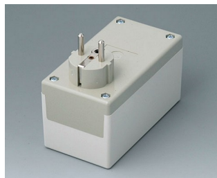
A9021665 PLUG CASE F / D, Vers. I PC+ABS (UL 94 V-0) pebble gray RAL 7032 4.72"x2.56"x2.56"