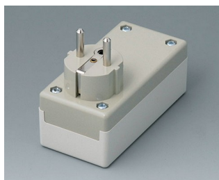
A9011665 PLUG CASE F / D, Vers. I PC+ABS (UL 94 V-0) off-white RAL 9002 3.94"x1.97"x1.57"