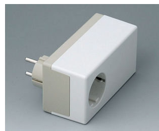
A9022465 PLUG CASE D, Vers. II PC+ABS (UL 94 V-0) pebble gray RAL 7032 4.72"x2.56"x2.17"