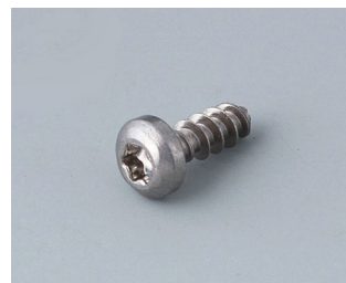
A0308132 Self-tapping screw 0.118" x 0.315" (T10) Stainless steel

Subject to technical modification without notice. © by OKW Gehäusesysteme, Buchen/Germany.