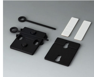
A9305019 Wall suspension elements ASA+PC-FR (UL 94 V-0) black RAL 9005