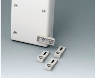
A9204108 Wall mounting brackets PA 6 pebble gray RAL 7032