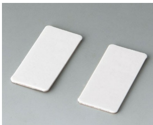
A9305147 Adhesive foil holder

Subject to technical modification without notice. © by OKW Gehäusesysteme, Buchen/Germany.