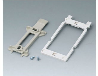
B1350048 Wall suspension elements ABS (UL 94 HB) pebble gray RAL 7032