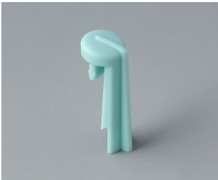
A1105005 Arrow PA 6 (UL 94 HB) lagoon