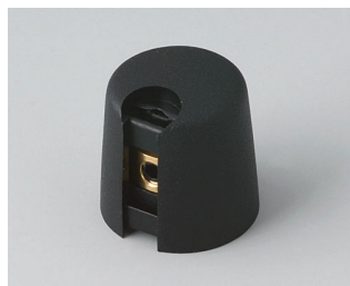
A1016049 TOP-KNOBS 16 PA 6 nero 16x16mm 4mm