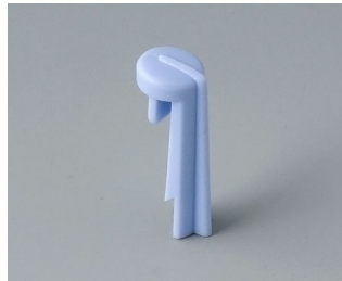
A1105006 Arrow PA 6 (UL 94 HB) sky