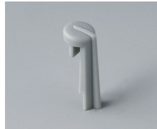
A1105007 Arrow PA 6 (UL 94 HB) mineral

Subject to technical modification without notice. © by OKW Gehäusesysteme, Buchen/Germany.