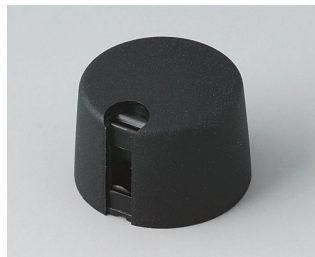
A1024649 TOP-KNOBS 24 PA 6 nero 24x16mm