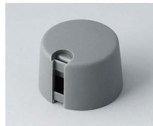
A1024048 TOP-KNOBS 24 PA 6 volcano 24x16mm 4mm