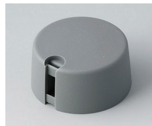
A1031638 TOP-KNOBS 31 PA 6 volcano 31x16mm 1/4"