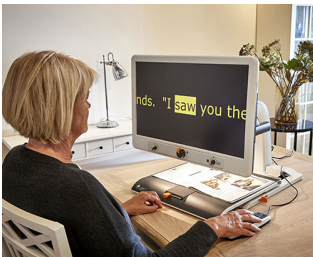
Control knobs for video magnifier