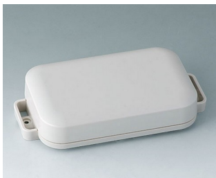
C3207107 EASYTEC 125 ASA+PC (UL 94 V-0) off-white RAL 9002 5.79"x3.07"x1.18" IP 65 opt., IP 40