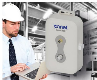
Sensor box for process monitoring