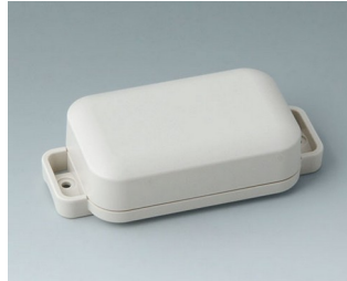
C3204207 EASYTEC 80 ASA+PC (UL 94 V-0) off-white RAL 9002 3.98"x1.97"x1.02" IP 65 opt., IP 40