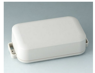
C3208207 EASYTEC 150 ASA+PC (UL 94 V-0) off-white RAL 9002 6.77"x3.66"x1.81" IP 65 opt., IP 40