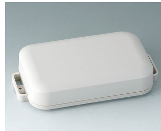
C3208107 EASYTEC 150 ASA+PC (UL 94 V-0) off-white RAL 9002 6.77"x3.66"x1.42" IP 65 opt., IP 40