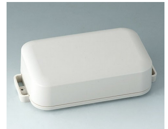
C3208207 EASYTEC 150 ASA+PC (UL 94 V-0) off-white RAL 9002 6.77"x3.66"x1.81" IP 65 opt., IP 40