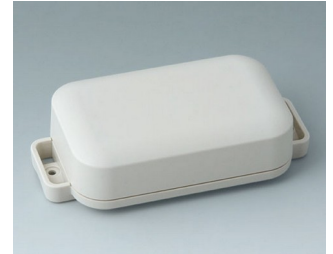
C3206207 EASYTEC 100 ASA+PC (UL 94 V-0) off-white RAL 9002 4.76"x2.44"x1.22" IP 65 opt., IP 40