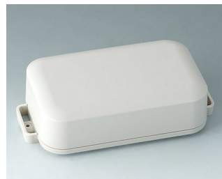
C3208207 EASYTEC 150 ASA+PC (UL 94 V-0) off-white RAL 9002 6.77"x3.66"x1.81" IP 65 opt., IP 40