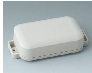
C3206207 EASYTEC 100 ASA+PC (UL 94 V-0) off-white RAL 9002 4.76"x2.44"x1.22" IP 65 opt., IP 40