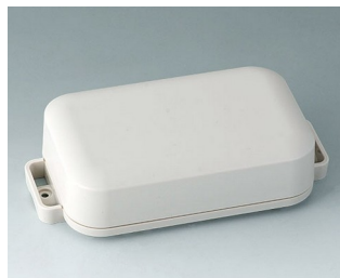
C3207207 EASYTEC 125 ASA+PC (UL 94 V-0) off-white RAL 9002 5.79"x3.07"x1.46" IP 65 opt., IP 40