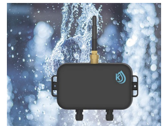
Water level monitoring