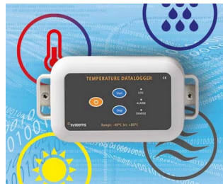
Data logger e.g. for temperature