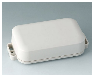
C3207207 EASYTEC 125 ASA+PC (UL 94 V-0) off-white RAL 9002 5.79"x3.07"x1.46" IP 65 opt., IP 40