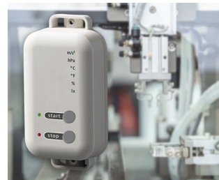
Data logger with gateway function