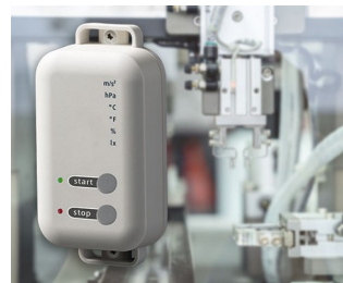
Data logger with gateway function