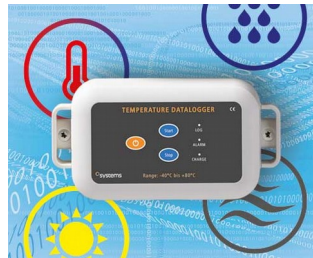
Data logger e.g. for temperature