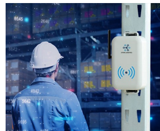
Smart store logistics