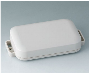
C3207107 EASYTEC 125 ASA+PC (UL 94 V-0) off-white RAL 9002 5.79"x3.07"x1.18" IP 65 opt., IP 40