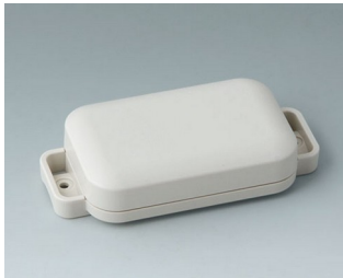
C3204107 EASYTEC 80 ASA+PC (UL 94 V-0) off-white RAL 9002 3.98"x1.97"x0.87" IP 65 opt., IP 40