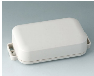
C3207207 EASYTEC 125 ASA+PC (UL 94 V-0) off-white RAL 9002 5.79"x3.07"x1.46" IP 65 opt., IP 40