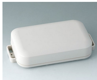
C3208107 EASYTEC 150 ASA+PC (UL 94 V-0) off-white RAL 9002 6.77"x3.66"x1.42" IP 65 opt., IP 40