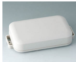
C3208107 EASYTEC 150 ASA+PC (UL 94 V-0) off-white RAL 9002 6.77"x3.66"x1.42" IP 65 opt., IP 40