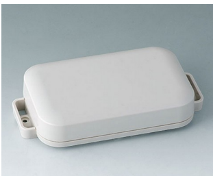
C3207107 EASYTEC 125 ASA+PC (UL 94 V-0) off-white RAL 9002 5.79"x3.07"x1.18" IP 65 opt., IP 40