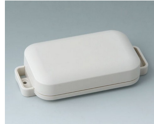
C3206107 EASYTEC 100 ASA+PC (UL 94 V-0) off-white RAL 9002 4.76"x2.44"x1.02" IP 65 opt., IP 40