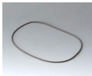
A9503030 Sealing 125