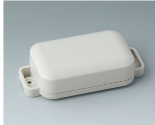
C3204207 EASYTEC 80 ASA+PC (UL 94 V-0) off-white RAL 9002 3.98"x1.97"x1.02" IP 65 opt., IP 40