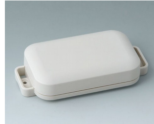
C3206107 EASYTEC 100 ASA+PC (UL 94 V-0) off-white RAL 9002 4.76"x2.44"x1.02" IP 65 opt., IP 40