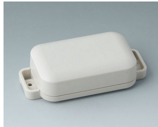
C3204207 EASYTEC 80 ASA+PC (UL 94 V-0) off-white RAL 9002 3.98"x1.97"x1.02" IP 65 opt., IP 40