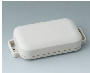
C3206107 EASYTEC 100 ASA+PC (UL 94 V-0) off-white RAL 9002 4.76"x2.44"x1.02" IP 65 opt., IP 40