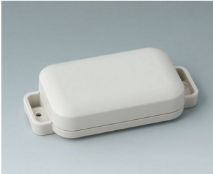
C3204107 EASYTEC 80 ASA+PC (UL 94 V-0) off-white RAL 9002 3.98"x1.97"x0.87" IP 65 opt., IP 40