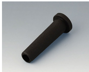
C2353849 Flexible cable grommet Ø 5,3 black