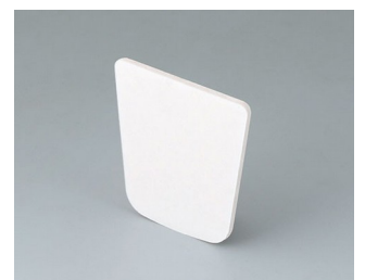
B2903031 Adhesive foil M