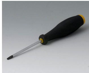
A0399T10 Torx T10 screwdriver

Subject to technical modification without notice. © by OKW Gehäusesysteme, Buchen/Germany.