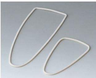
B2904111 Sealing kit L TPV 50A