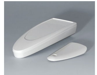
B2803017 STYLE-CASE M ASA (UL 94 HB) traffic white RAL 9016 5.79"x2.20"x1.06" IP 65 opt., IP 40