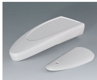
B2804017 STYLE-CASE L ASA (UL 94 HB) traffic white RAL 9016 6.54"x2.52"x1.22" IP 65 opt., IP 40