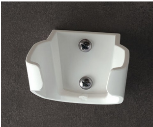
B2903037 Holder M ASA (UL 94 HB) traffic white RAL 9016