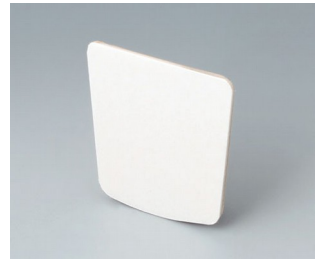
B2904031 Adhesive foil L