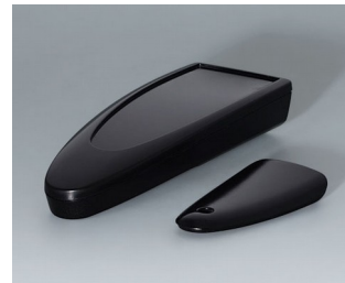
B2803016 STYLE-CASE M PMMA (IR) (UL 94 HB) black RAL 9005 5.79"x2.20"x1.06" IP 65 opt., IP 40