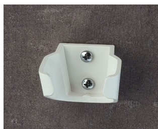
B2902037 Holder S ASA (UL 94 HB) traffic white RAL 9016