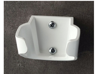
B2904037 Holder L ASA (UL 94 HB) traffic white RAL 9016