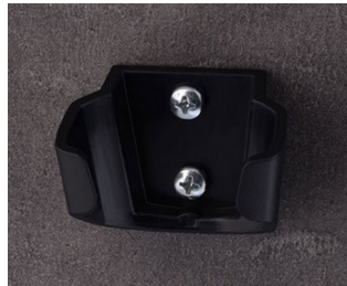
B2903039 Holder M ASA (UL 94 HB) black RAL 9005