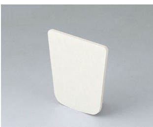
B2902031 Adhesive foil S