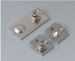
A9190020 Set of battery clips Steel nickel-plated