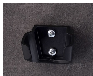
B2902039 Holder S ASA (UL 94 HB) black RAL 9005