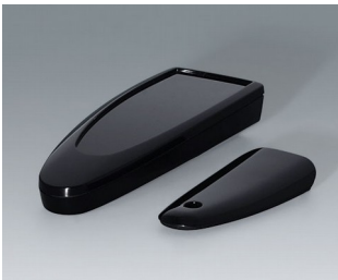
B2802016 STYLE-CASE S PMMA (IR) (UL 94 HB) black RAL 9005 4.84"x1.89"x0.94" IP 40