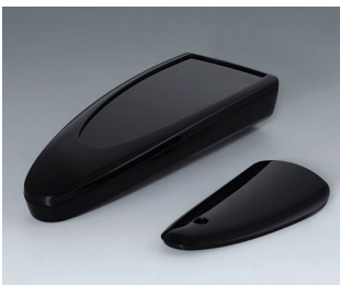
B2804016 STYLE-CASE L PMMA (IR) (UL 94 HB) black RAL 9005 6.54"x2.52"x1.22" IP 65 opt., IP 40