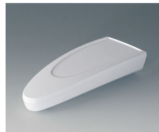
B2804027 STYLE-CASE L ASA (UL 94 HB) traffic white RAL 9016 6.54"x2.52"x1.22" IP 65 opt., IP 40