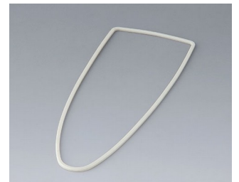
B2904011 Sealing L TPV 50A