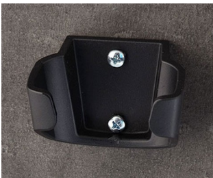
B2904039 Holder L ASA (UL 94 HB) black RAL 9005