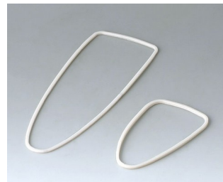
B2903111 Sealing kit M TPV 50A