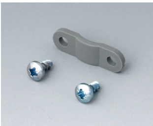
A9199005 Strain relief PA 6 volcano