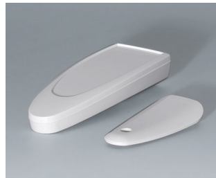
B2802017 STYLE-CASE S ASA (UL 94 HB) traffic white RAL 9016 4.84"x1.89"x0.94" IP 40