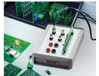
Testing of electronic components