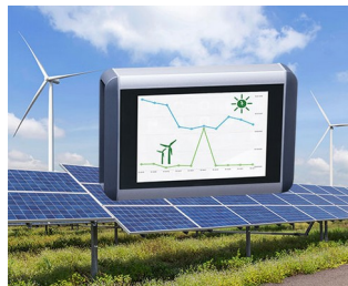
Smart meter for wind power and solar systems