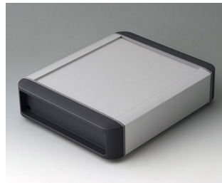
B3407012 SMART-TERMINAL 160 Aluminum AlMgSi 0.5 matt anodized 7.95"x6.69"x1.97" IP 54