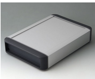
B3407022 SMART-TERMINAL 200 Aluminum AlMgSi 0.5 matt anodized 9.53"x6.69"x1.97" IP 54