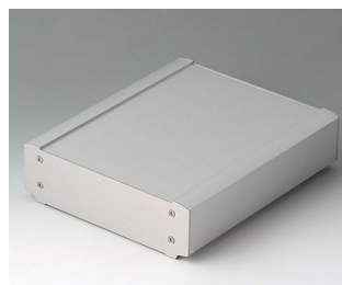
B3407023 SMART-TERMINAL 200 Aluminum AlMgSi 0.5 matt anodized 8.03"x6.69"x1.97"