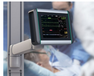
Surveillance monitor for vital signs