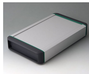
B3407031 SMART-TERMINAL 240 Aluminum AlMgSi 0.5 matt anodized 11.10"x6.69"x1.97" IP 54