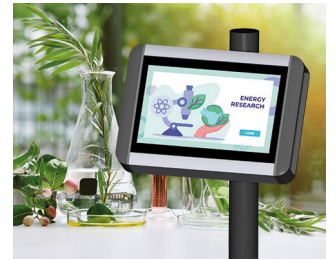
Plant research terminal