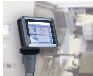
Multi-touch panel for machine control