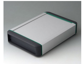
B3407021 SMART-TERMINAL 200 Aluminum AlMgSi 0.5 matt anodized 9.53"x6.69"x1.97" IP 54