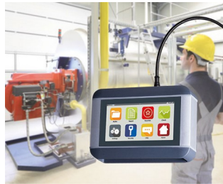
Mobile diagnostic device for machines and plants