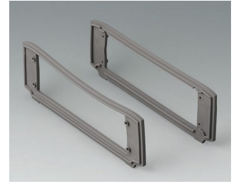
B3507017 Designer seals set, volcano TPV 50A volcano