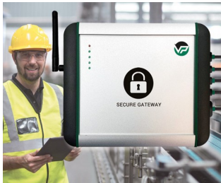
Industrial Secure Gateway

Peripheral and interface equipment, office, communications technology, safety engineering, biometrics, medical and laboratory technology, health care, automation, smart factory, industry 4.0, gateways, measurement and control engineering, etc.