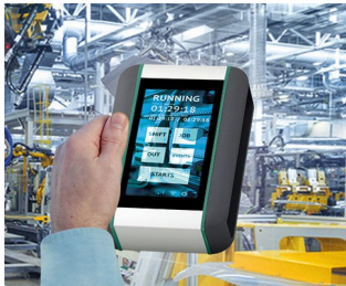
Machine real-time monitoring system