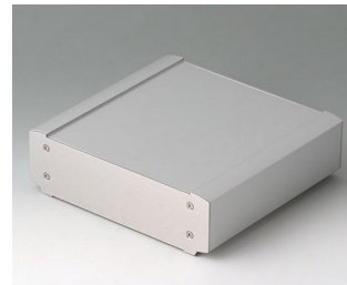
B3407013 SMART-TERMINAL 160 Aluminum AlMgSi 0.5 matt anodized 6.46"x6.69"x1.97"