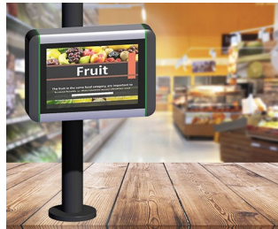
Information terminal at the point of sale