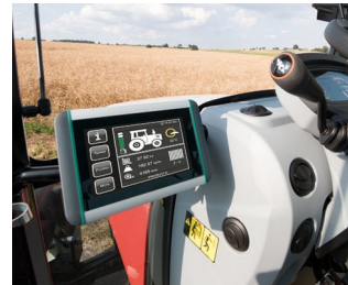
ISOBUS terminal for tractors and self-propelled machines