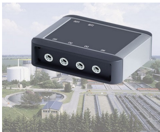
Process control of plants